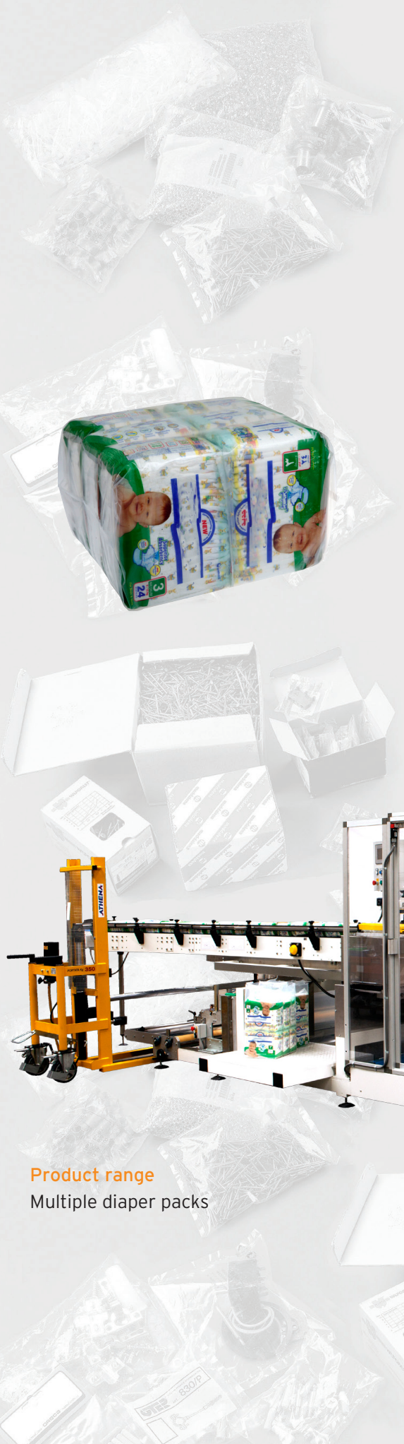
Product range Multiple diaper packs

Intermittent movement horizontal wrapping machine suitable for wrapping large size products in multiple packages using polyethylene film. It can replace cardboard boxes which generates packaging savings.